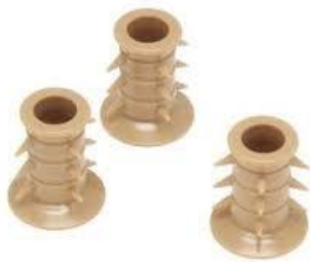
Plastic CPE lure head without felt

Soaking the felt in the 'lure' for about a week prior to deployment ensures the scent is maintained on the lure head for up to four weeks of deployment.