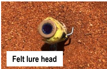
Felt lure head

Use the plastic spiked lure heads and attach a felt strip (1.5cm wide x 10cm long) around the lure head.