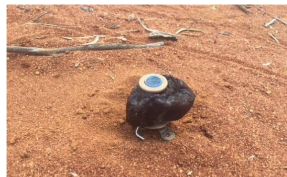
'Off the shelf' kangaroo dried meat lure

It is highly recommended in Western Australia to use the felt lure head with a novel smell upon it for effective wild dog and fox control.