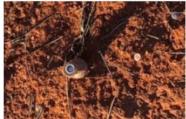
CPE that has been fired - poison capsule broken

The dried meat or any form of food based lure heads are not recommended where non-target numbers are high, particularly goannas or bungarras.