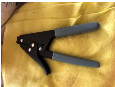
Zip tie tightener