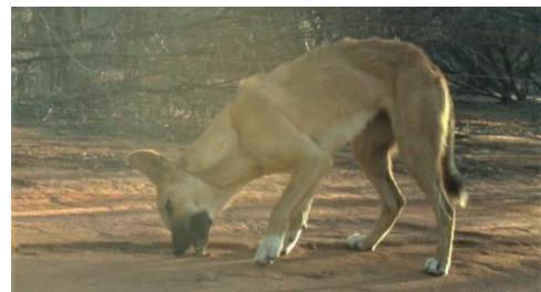
Wild dog interacting with a CPE

Three weeks is optimal to ensure there is limited human interference (as to not deter wild dog or fox activity) and the CPE is still able to function correctly. Servicing with lanolin or paraffin oil is recommended.